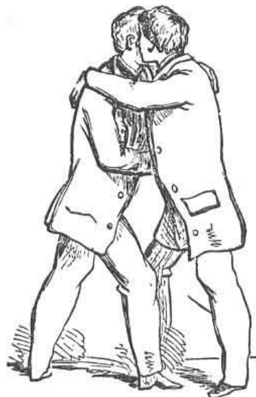
ILLUSTRATION FROM DUNCANS RITUAL

The author is a Past Grand Master and Past Grand Secretary of the Grand Lodge of California. He currently serves as President of the Philalethes Society. This "Short Talk" was originally published in the June/July, 2016 issue of the California Freemason.